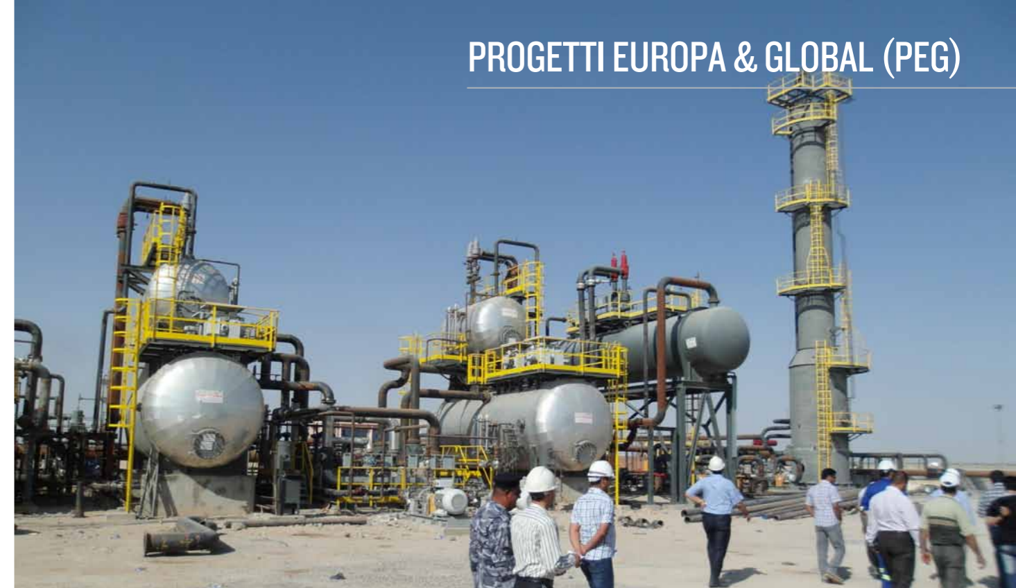
Dehydration and desalting unit

Coming back to the different types of activities PEG runs, it's not easy to compare the contribution to the company from the two sides of the business. Certainly, the oil and gas sector brings in the majority of revenue earned as it contains a considerable