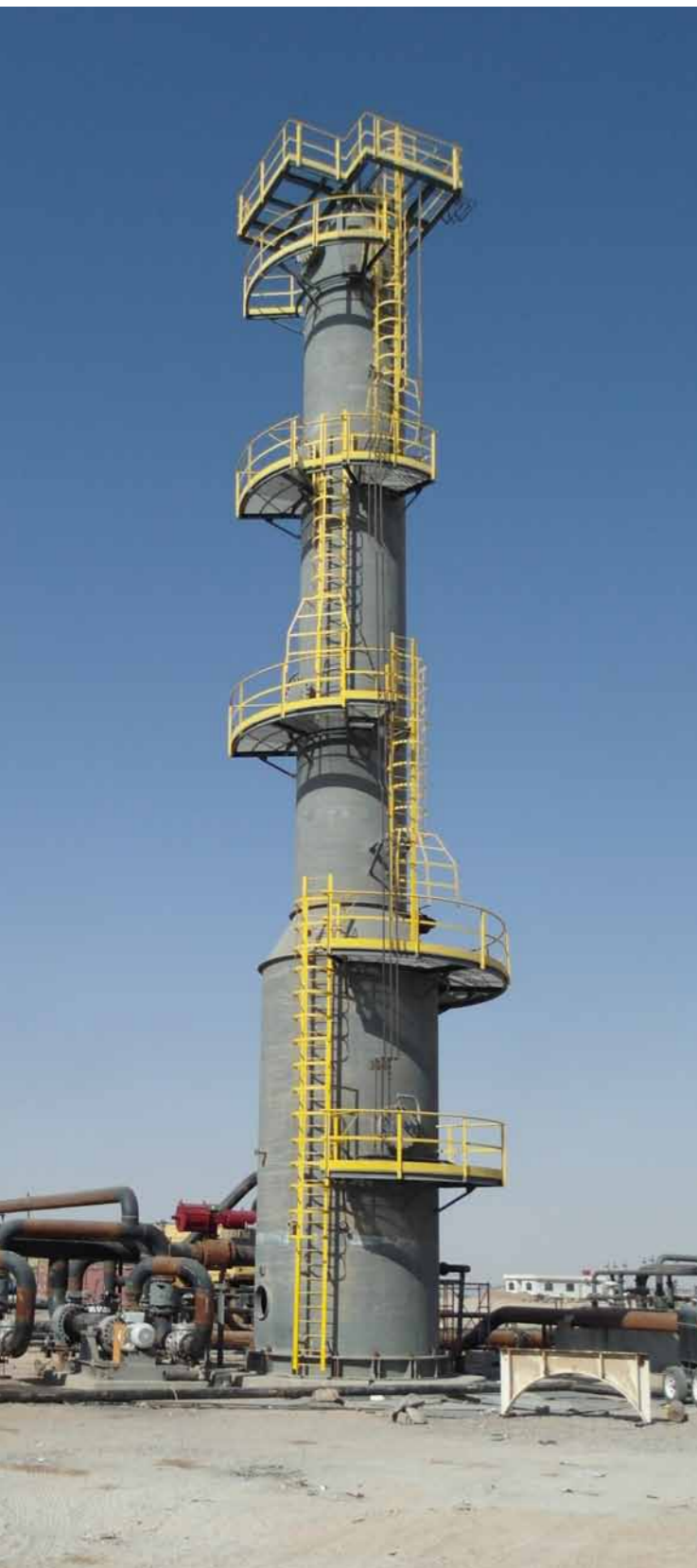
Crude oil stripping column