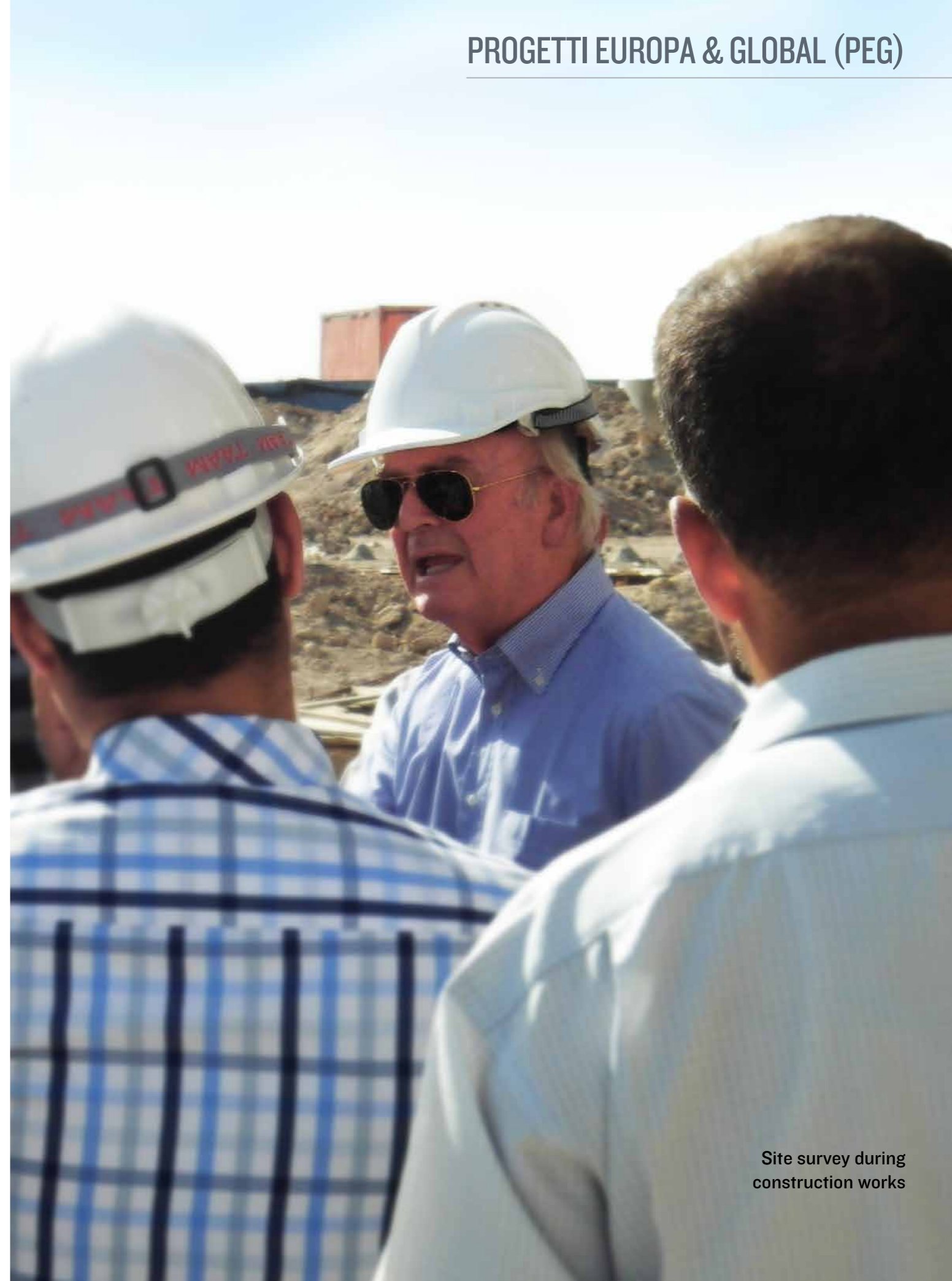
Site survey during construction works

..... Contract to build a new pumping station at Al Habaneya